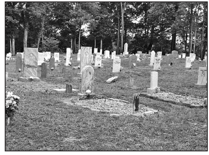
The Towns County Chamber of Commerce, in conjunction with the Ivy Mount Cemetery, will be giving a reenactment tour of the historic cemetery on Nov. 11, 12, 18 and 19.

"Interstate 3, which would have been a highway disaster from nuclear waste from Savannah, not to mention tearing through what we know as Hiawassee, was defeated.