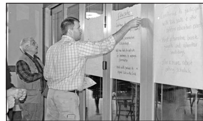
Attendees of the 2016 State of the Water prioritized which issues were most important to them concerning the Hiwassee River Watershed.

As of right now, there is no definitive answer to solve this problem. Moore suggests water conservation and to pay close attention to